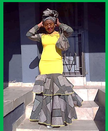
The Founder and Project Director of TSCC at Stand Foundation training.

The training was very educative and some of the methodologies are already being applied at the organisation. Overall, the event was a success and we're only getting better as an organisation.